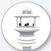
SP276 Weather Station based on GILL module