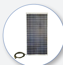
SB371 Solar Panel to Monitoring Station