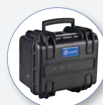
SB275 External 33 Ah Battery to Monitoring Station