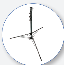
SA206 Mast for Microphone Protection Kit